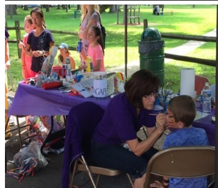
Free Face Painting