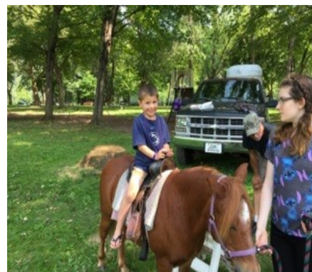
Free Pony Rides

The Palooza Festival on August 26th was a huge success and we had a great turnout. Thanks to all who came out and supported us!