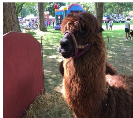
Free Petting Zoo