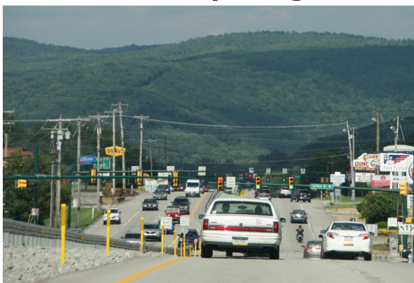
An innovative program allows participants to register and post their own profiles to create the best possible matches for a carpool.

Participants self-register, editing their own profiles to create the best possible matches for a carpool. Access to match lists is instant and available 24/7. It takes time to build a data base so participants should not become discouraged if they do not obtain a match right away. Notification is sent when a match become available. If