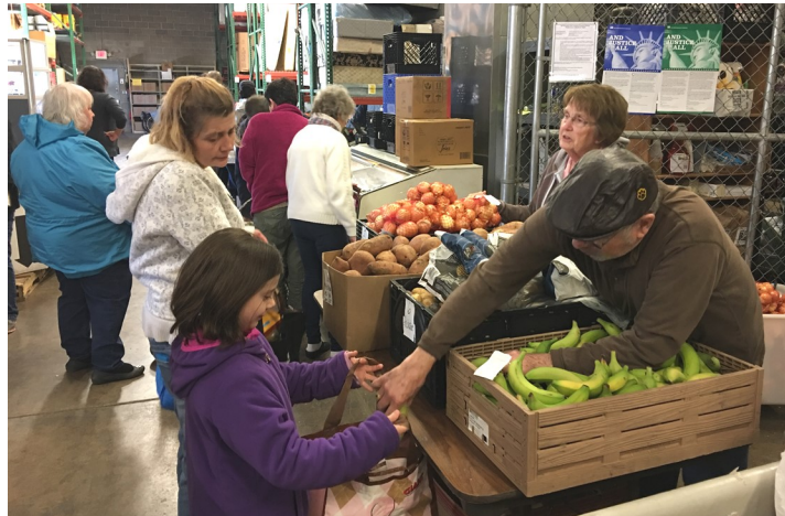
A local child receives fresh produce from one of the many volunteers at Fresh Express on Thursday, March 9th, 2017.