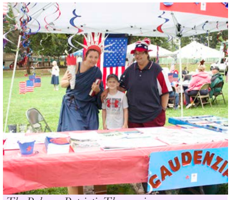
The Palooza Patriotic Theme winner was GAUDENZIA. They received a $100 Gift card from AMAZON.

A love offering will be taken to help the AGAPE Heating Assistance Fund.